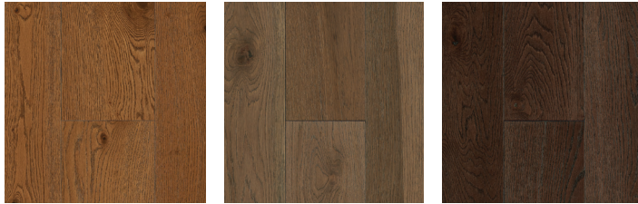
Saddle 7-1/2" AWEK224W After Dusk 7-1/2" AWEK244W Woodsy Character 7-1/2" AWEK289W