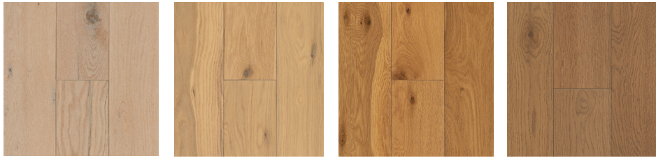
Serene Moment 7-1/2" AWEK254W Spring Shade 7-1/2" AWEK274W Natural 7-1/2" AWEK204W Field And Forest 7-1/2" AWEK284W